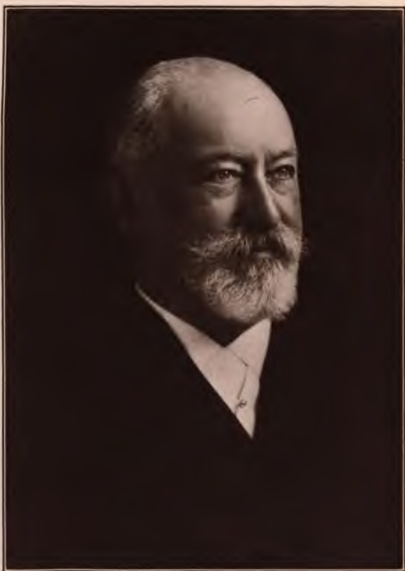
JACOB H. SCHIFF